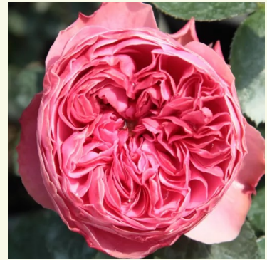
Leonardo da Vinci®

crimson-red - english rose 3.8-5.2ft (115-160 cm) very strongly scented, long-lasting rose - scent description not available David Charles Henshaw Austin