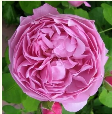
Charles Rennie Mackintosh

pink - nostalgia rose 2.5-3.6ft (75-110 cm) very strong, noticeable from a distance scented rose - classic, rose-fruity Dominique Massad