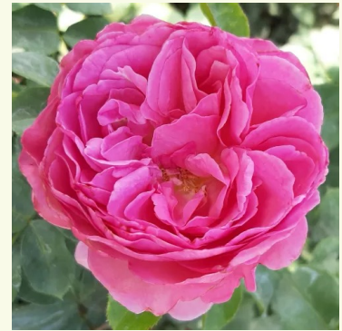
Renée Van Wegberg™

deep-red - nostalgia rose 2.5-3.4ft (75-105 cm) very weak, barely noticeable scented rose - delicate, rose-like character Meiland International