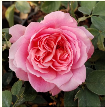
Festival des Jardins de C.

peach - nostalgia rose 3.3-4.9ft (100-150 cm) very strong, garden-filling scented rose - classic damask, rose-scented Heinrich Schultheis; Henry Bennett