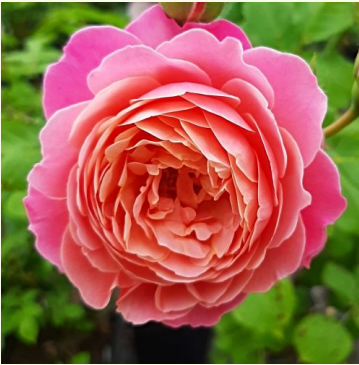
Prix P. J. Redouté

pink - nostalgia rose 2.6-3.9ft (80-120 cm) very strongly scented, garden-filling rose - deep, tea- vanilla aroma Dominique Massad