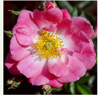
Rosa moyesii 'Eos'

white - landscape shrub rose #VALUE! strong, long-lasting scented rose - scent description not available