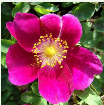
Rosa pimpinellifolia Single Cherry

dark-red - landscape shrub rose #VALUE! medium-strength, noticeably scented rose - rich, spicy, classic wild-rose-rosy aroma -