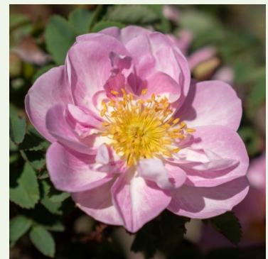
Rosa pimpinellifolia Mon Amie Claire

pink - landscape shrub rose #VALUE! medium-strength, noticeably scented rose - scent description not available Robert Brown