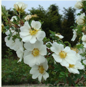
Rosa kokanica Vacratot

orange - landscape shrub rose #VALUE! strong, clearly scented rose - rich, sweet-spicy, slightly liquorice-anise