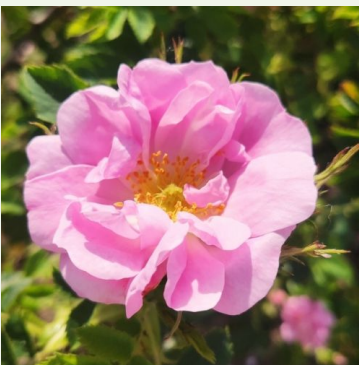
Rosa canina Abbotswood

yellow - species rose 13.8-25.6ft (420-780 cm) very weak, barely noticeable scented rose - classic rose character John Damper Parks