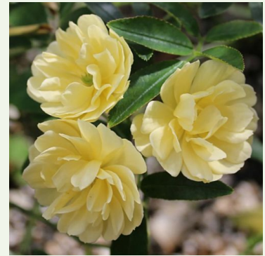
Rosa Banksiae lutea

white - species rose 13.1-26.2ft (400-800 cm) mild, restrained-scented rose - delicately floral character William Kerr