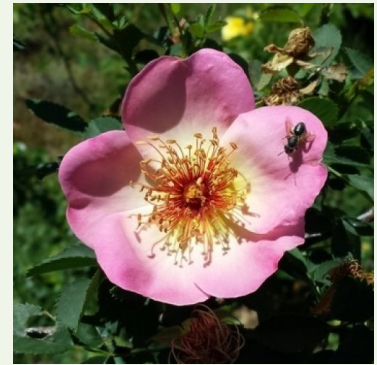
Rosa pimpinellifolia Frühlingsmorgen