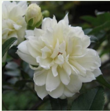
Rosa banksiae alba

white - historic - rambler, climbing - trailing rose #VALUE! strongly scented, easily noticeable rose - rich, spicy-musk aroma