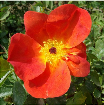
Rosa foetida bicolor

orange - landscape shrub rose #VALUE! strong, clearly scented rose - rich, sweet-spicy, slightly liquorice-anise