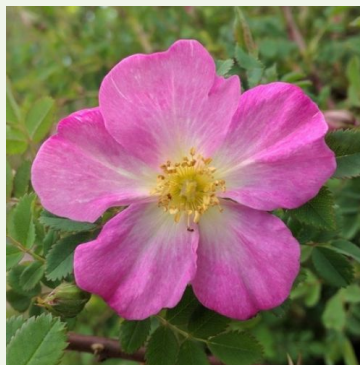
Rosa pimpinellifolia Mary Queen of Scots

pink - landscape shrub rose #VALUE! mild, understated-scented rose - delicate, spicy-herbaceous