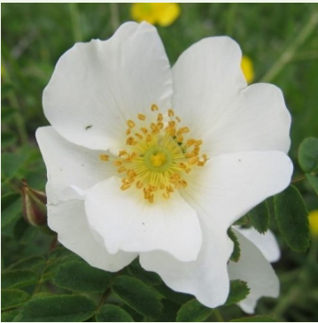
Rosa omeiensis pteracantha

pink - wild rose 6.6-9.8ft (200-300 cm) very weak, barely noticeable scented rose - scent description not available Ruys