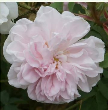
Rosa pimpinellifolia Marbled Pink

pink-yellow - landscaping shrub rose #VALUE! medium-strength, clearly scented rose - muscatel, wild-rose-violet, light floral Wilhelm J. H. Kordes II.